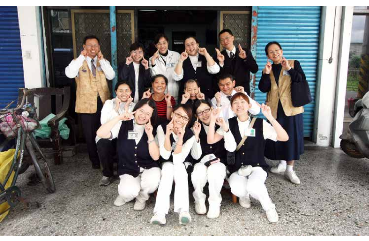
Though this is an outside-of-work volunteer program, the RCC team is glad that they can visit the discharged patients. They are even more delighted when seeing many patients are able to live without a ventilator.

After our home visits were finished for the day, we hurried back to the hospital and discussed what we had seen. Even