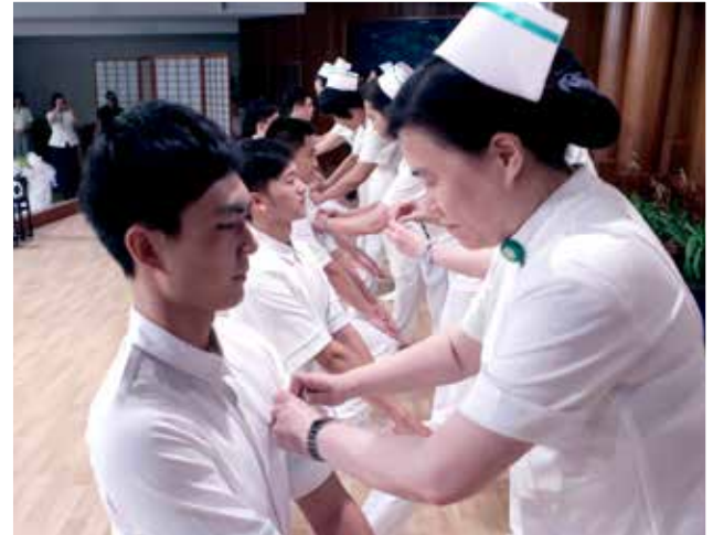
Teachers wear the caps for students

"Apply nursing expertise to serve others, promote the empathetic spirit of Tzu Chi."