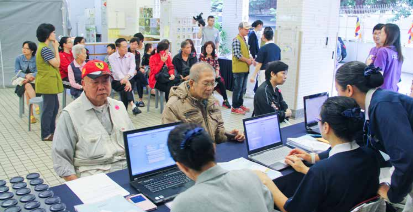
The Buddhist Tzu Chi Foundation (Hong Kong) and the Neighborhood Advice-Action Council (NAAC) hosted a Medical Outreach in Tung Chung. Volunteers assist the residents to make appointments.

services in Chinese Medicine, Gynecology, General Medicine, Chiropractic Services, Pediatrics and Psychiatric care to ensure full service care was provided to the people of Tung Chung.